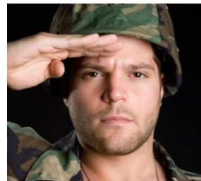
Military and Volunteer Service