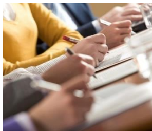
Training Courses and/or Certifications